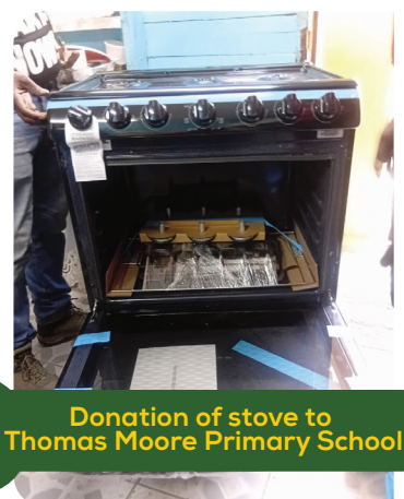
Donation of stove to Thomas Moore Primary School

St. Thomas Moore Primary School: In September 2024, Blossoms donated a stove to St. Thomas Moore Primary School. The donation will help students by being exposed to culinary skills, enabling them to be self-sufficient. In addition, teachers will be able to complete expository composition in more detail since pupils can observe the steps taken to arrive at the finished product. Lastly, the equipment will assist the school in fund raising activities on the school's premises to prepare food items when needed.