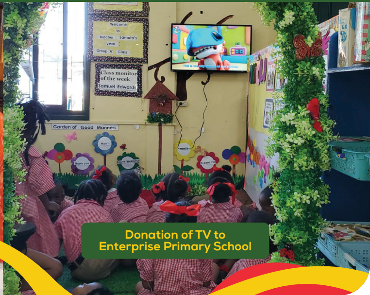
Donation of TV to Enterprise Primary School