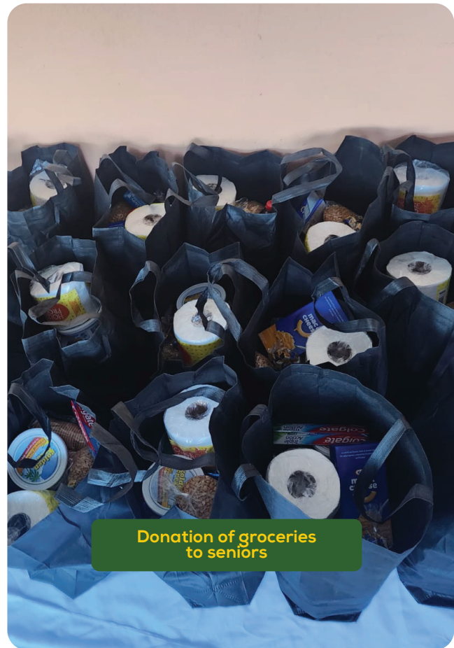
Donation of groceries to seniors